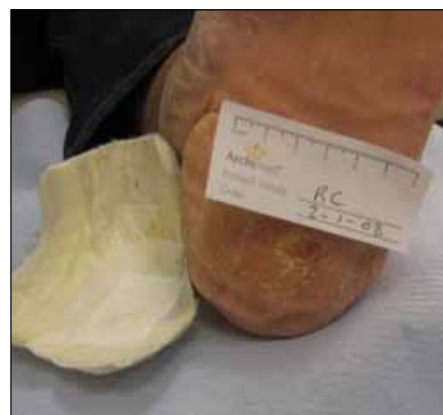
Figure 4. Following 17 weeks of treatment with the glucose oxidase dressing, Mr R's ulcer closed in January 2008.