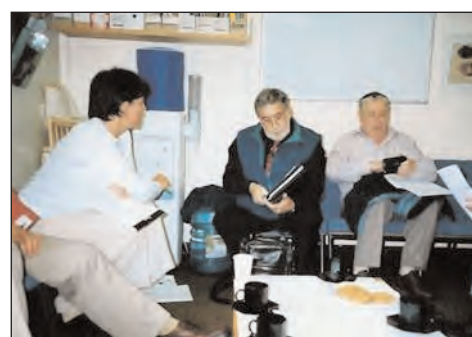
Figure 1. Three members of the user group analysing focus group transcripts.