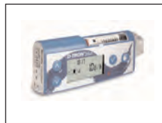
Figure 1. An insulin pump

Insulin pumps have been approved by NICE for people with type 1 diabetes using multiple injection therapy, who are still unable to achieve an HbA 1c lower than 7.5% without disabling hypoglycaemia (NICE, 2003). Although many diabetes centres have yet to initiate pump therapy, their use has steadily increased since 1998 (Everett, 2003). Insulin pumps provide the advantage of greater flexibility of lifestyle for people with diabetes because they allow close titration of insulin doses to meet changing requirements throughout the day. Also, and perhaps most importantly, changes in insulin doses provide predictable responses to a much greater degree than any current multiple injection regimen (Wilson, 2003; Bode et al, 1996). However, many of the advantages of this system will be lost if the person wearing the pump does not actively manage their blood glucose levels on a day-to-day basis. Figure 1 shows an example of a pump.