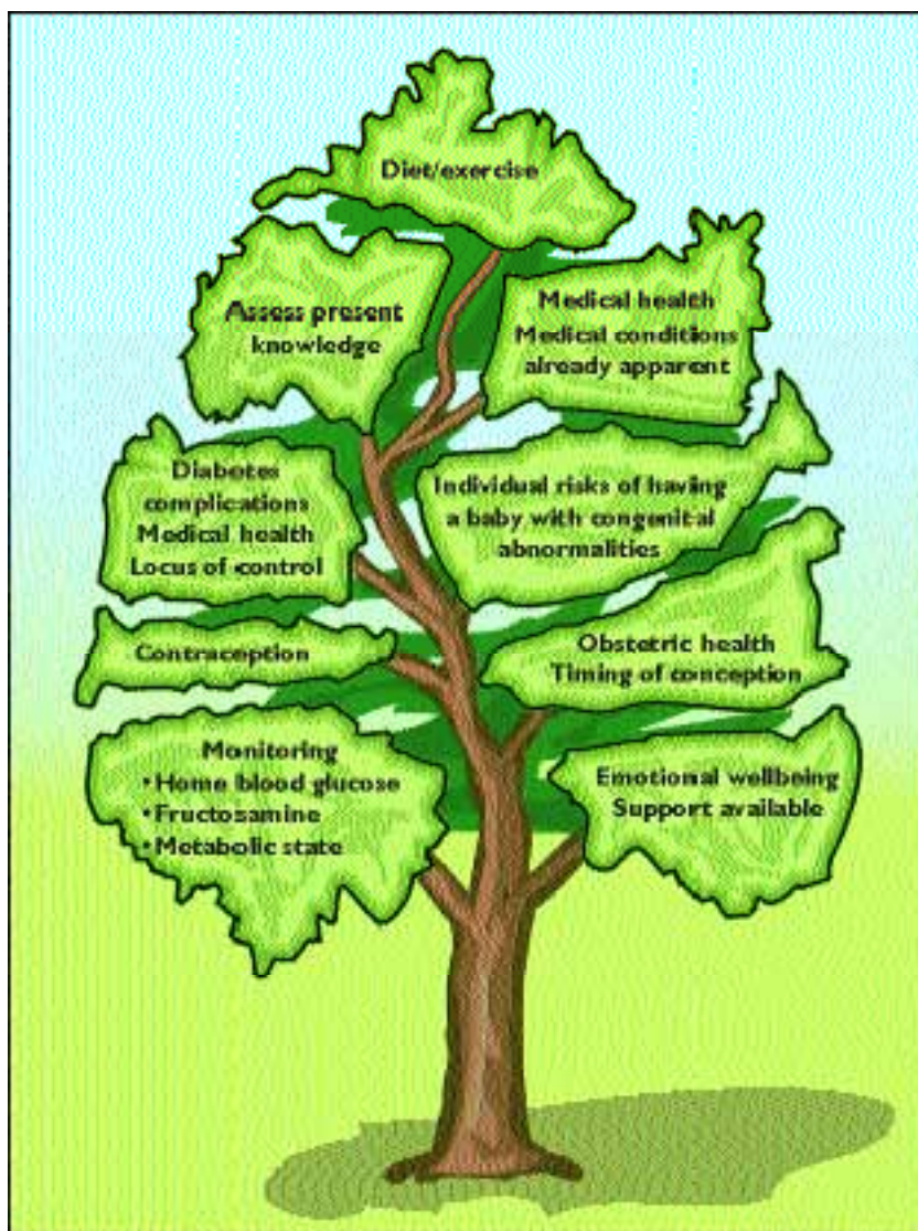
Figure 2. Assessment tree, showing assessments needed at registration for preconceptual care.

So far, in the areas of greatest need, enrolment into preconceptual care clinics has been less than 50%. The drop-out rate is also high (52%), this is thought to be due to an inability to conceive as quickly as expected and also due to a dislike of the strict regime (Gregory and Tattersall, 1992). These authors found that patients who did book preconceptually were likely to be the more motivated, already having