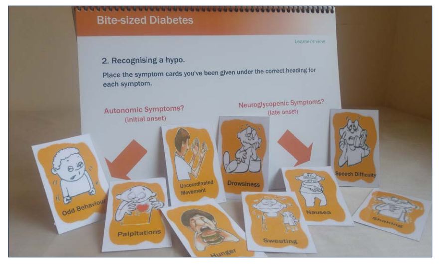
Figure 2. An interactive page of the flip chart. Learners are asked to match the appropriate cards to the two types of hypoglycaemia symptom.

Before the flip chart was developed, alternative options for the training resource were considered, including a leaflet and a poster. Although leaflets are relatively easy to produce and are small enough to be placed in the learner's pocket for future reference, they were deemed to be a good supplement to the flip chart rather than a standalone resource. There are already a number of patient information leaflets on hypoglycaemia, which staff have access to, but these do not seem to have had the desired impact of improving knowledge and treatment of hypoglycaemia,