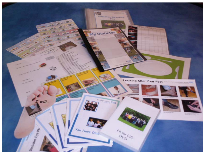
Figure 1. Many different resources were developed.

A training package was also developed to educate family members and carers on how to administer insulin. This then enabled the patients to continue attendance at their learning disability centres. This training package has also proved useful in educating other non-registered nurses in the practice of administering insulin and has been used across the Trust.