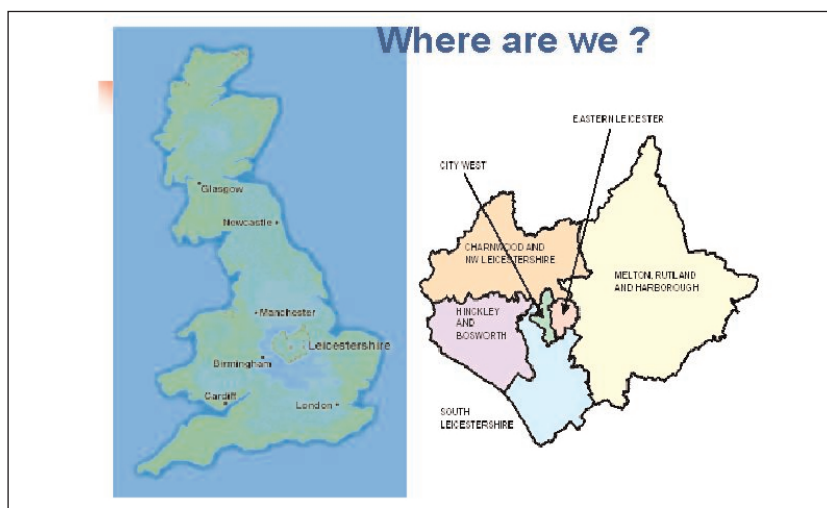
Figure 1. Primary care trusts in Leicestershire and Rutland

The key findings are summarised in Figure 2. The estimated prevalence of diabetes in 2002 was 5000. The baseline audit identified 6895 (3.8%) people with diabetes.