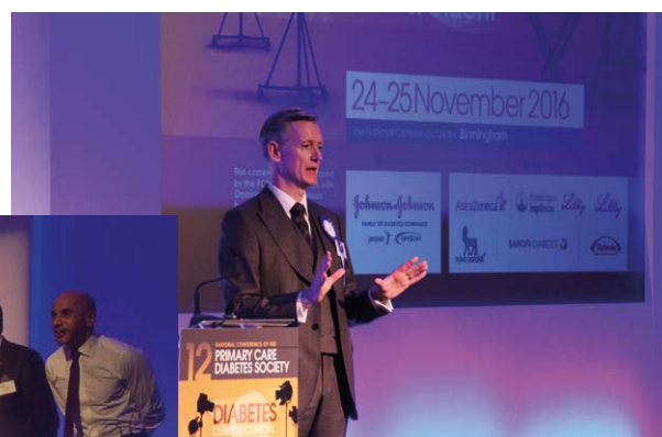
Photos from the 12 th National PCDS Conference.