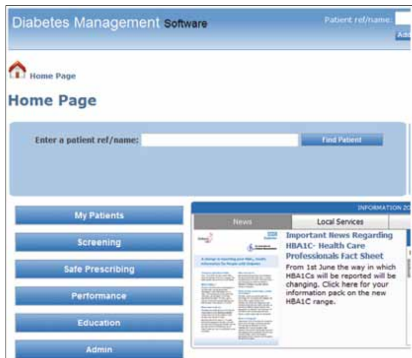
Figure 2. Healthcare professional menu in www.diabetesmanager.org.uk.

The concept of giving individuals complete information on their diabetes control raised initial concerns that this would create increased anxiety and rebound workload; however, no evidence of this was found, although a problem did arise for those who had an excessive “natural” UKPDS risk (especially older men). Their comparative small benefit in “risk” by achieving their diabetes targets was a disincentive and thus the UKPDS risk calculation was removed from the patient interface and reports.