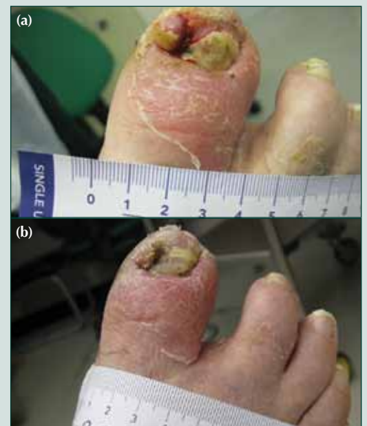
Figure 2. (a) At presentation, Mr F’s wound had been stalled for 2 weeks. (b) At day 10, there had been a significant reduction in overgranulation, bleeding, signs of infection and exudate.

Mr B is 80 years old, has diabetes, a history of ulceration on both feet and Charcot neuropathy