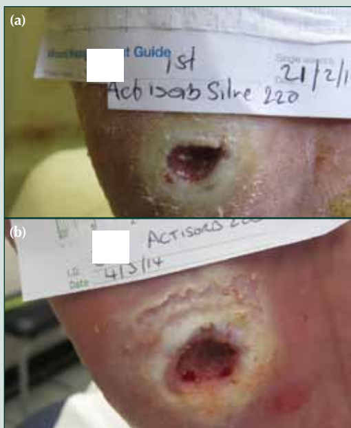
Figure 3. (a) Mr B’s wound was of moderate depth with callused edges, slough, periwound maceration and moderate exudate at presentation. (b) After 11 days, the wound had reduced in size and exudate reduced.

As there were still signs of infection, it was decided to continue with the ACTISORB Silver 220 dressing. Mr B returned 10 days later. The ulcer size was unchanged and periwound maceration present. The exudate level had increased to moderate. There was no odour or infection and the granulation had improved, so the dressing was discontinued.