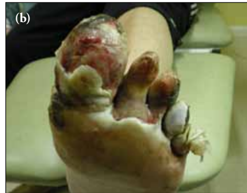
Figure 1. Mr F's left foot at presentation, the (a) dorsal and (b) plantar aspects are shown. Note the surrounding cellulitis, blackened toes.

extended to both the dorsal and plantar aspects of the foot with surrounding cellulitis, blackened toes and purulent exudates (Figure 1). Mr F reported noticing blistering on his foot after attending a sauna for a steam shower 1 week earlier.