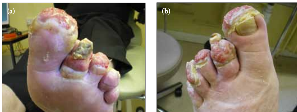
Figure 4. Mr F's left foot 12 weeks after presentation, the (a) plantar and (b) dorsal aspects are shown.

Burns of the neuropathic foot may be caused by unusual aetiologies. Standing or walking