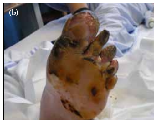
Figure 2. Mr F's left foot at discharge from hospital (2 weeks after presentation), the (a) dorsal and (b) plantar aspects are shown.