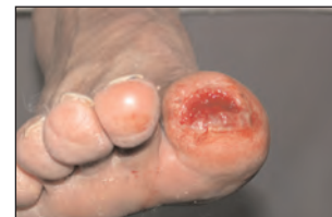
Figure 4 (above). The exposed bone was removed at the subsequent visit.

Figures 5 and 6 (below). The antimicrobial and foam dressings were applied after debridement on subsequent visits to complete healing.