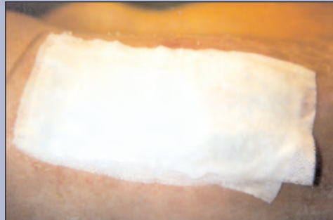
Figure 3. Secondary dressing in place (patient 1)