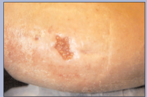
Figure 5. Wound in final stages of healing (patient 1)