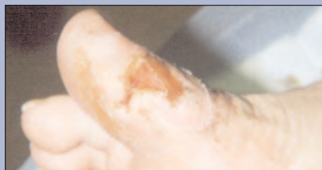
Figure 8. Wound showing improvement (patient 2)

‘By involving the patient in his own treatment, he felt useful, involved and became increasingly knowledgeable about his situation. This solution was time and cost effective for the podiatry team as the patient only required an appointment at weekly intervals rather than the 2–3 times weekly that would have been expected given the complicated nature and level of exudate from this wound.’