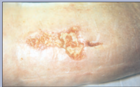
Figure 4. Wound showing significant healing (patient 1)