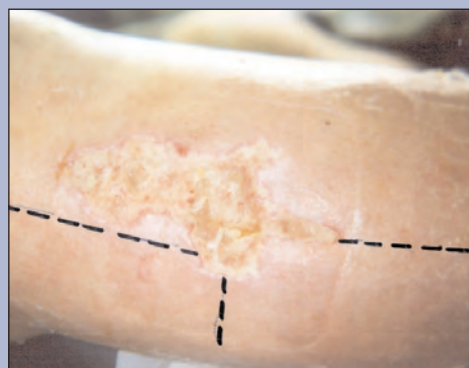
Figure 1. Initial picture of wound; dashed lines indicate tracking sinuses (patient 1)

'It is increasingly recognised that people with diabetes are more likely to have depression. It is estimated that the prevalence of depression and anxiety is about three times higher than in the general population.'