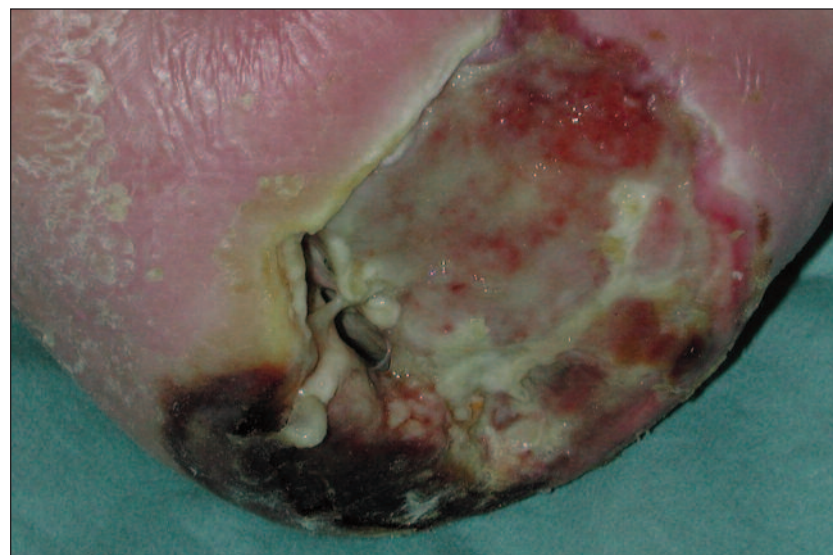
Figure 2. Severe infection, with extensive soft tissue loss and necrosis, including exposed and osteomyelitic bone, and systemic symptoms.

greater diversity of pathogens in these cases to include aerobic Gram-negative rods and anaerobes.