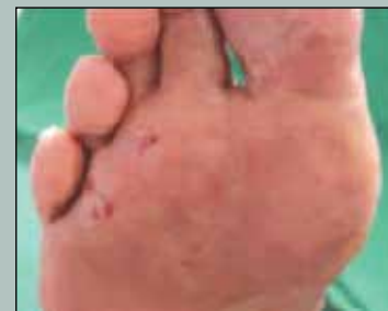
Figure 3. Follow-up visit at diabetic foot clinic, 4 weeks after initial presentation.