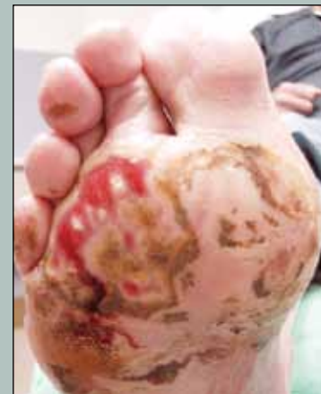
Figure 2. Follow up (day 14). Wound after 14 days of treatment with ACTICOAT Moisture Control dressing, almost healed.