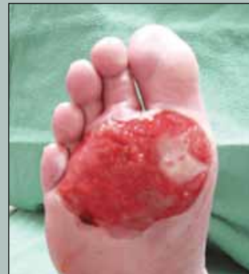
Figure 1. Initial (day 1) presentation of a person with type 2 diabetes with extensive partial-thickness skin loss after debridement. Left leg amputated previously following complications arising from infected neuropathic ulcer.