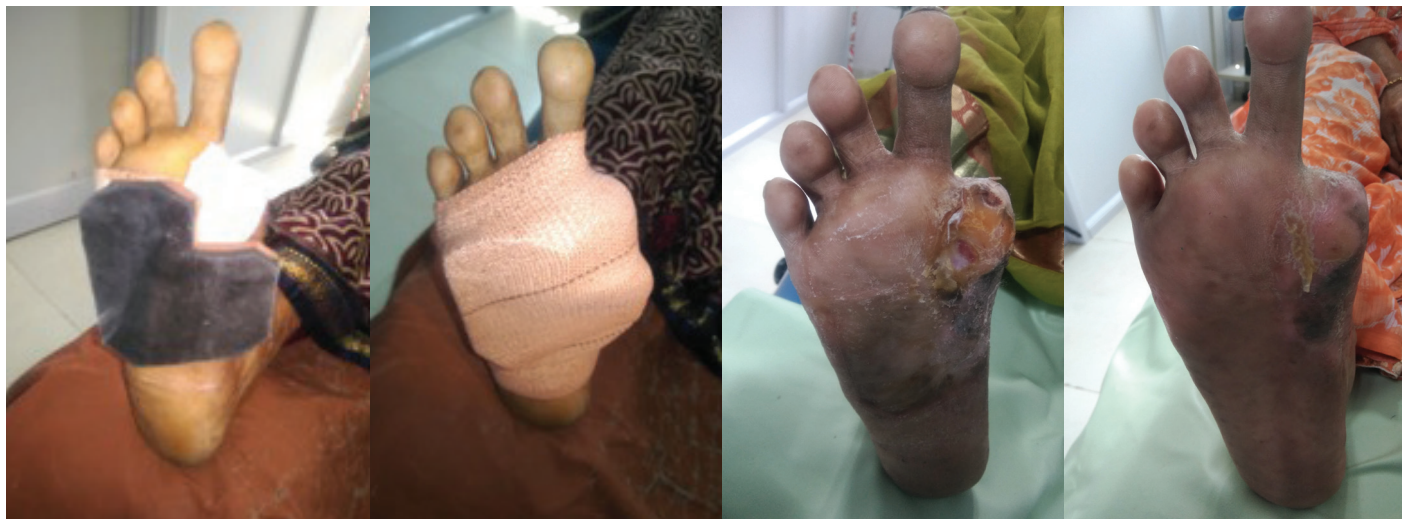
Figure 7. The application of Amit Jain's offloading in similar fashion as felted foam.