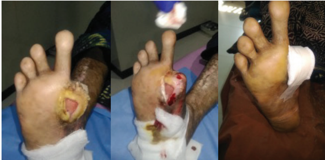
Figure 1 (left). Shows the non-healing trophic ulcer at first MTP region of right foot.