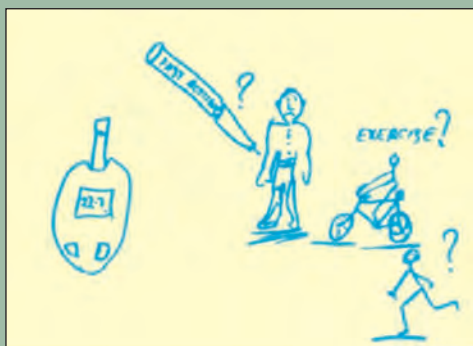
Figure 2. Example of a drawing from the third session. Facilitator instruction was ‘draw what happens in your home when your blood sugar is higher than 22.’ This drawing illustrates a pragmatic response, though a sad face is still apparent.

4 It is interesting to note that those who changed to a more intensive insulin regimen without taking part in the programme had no improvement in HbA 1c .