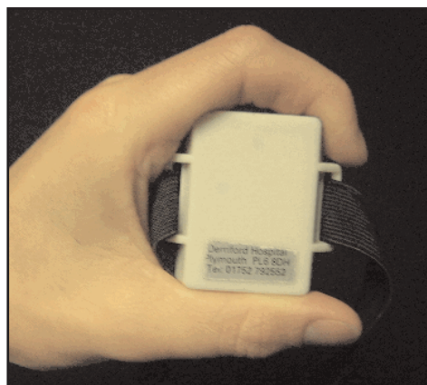
Figure 1. MTI accelerometer. Samples changes in acceleration 10 times per second. Records clock time, duration and intensity of movement.

A further, remarkable finding by Mallam et al (2003b) was that the variation in physical activity between children was attributable to the child, and not to his or her environment. Mallam et al (2003b) compared total physical activity over 1 week between children from three very different schools, where the timetabled physical activity varied from 9 hours per week in a private preparatory school to 1.8 hours per week in an inner-city school. Although children in the first school recorded the most activity during school