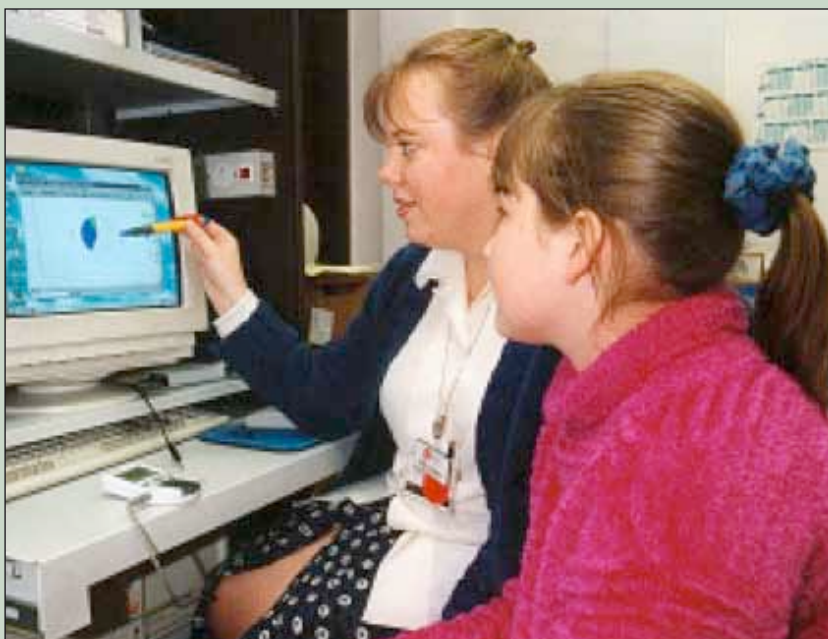
Downloading test results from the new blood glucose meters.

Some young people choose to drop in each week or two during difficult times to discuss their problems and targets, thereby developing a closer rapport with the