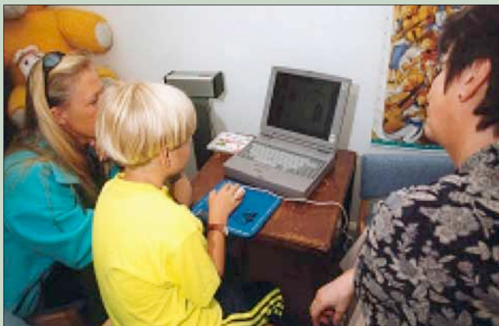
A child learning about the use of computers in diabetes management.