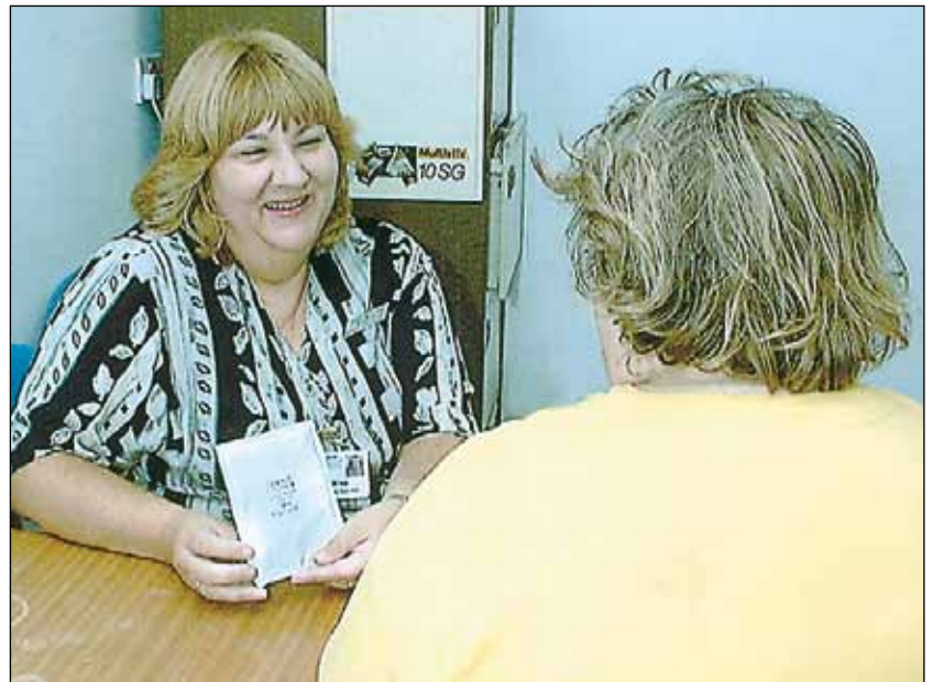
Figure 1. The nurse provided one-to-one sessions with all patients throughout the VLCD programme.

Insulin doses were decreased by two thirds on commencement of the programme, and this seemed to work well, with insulin doses continuing to decrease as weight loss proceeded. Most patients who remained on insulin were changed to nocte insulin