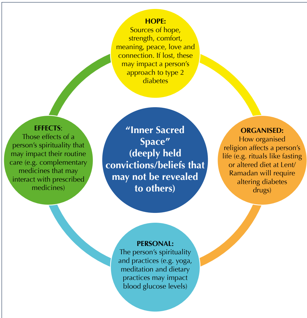
Figure 3. Adapted HOPE model (Anandarajah and Hight, 2001).