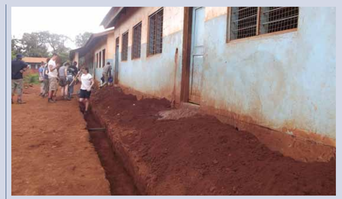
Figure 1. Part of the trip included renovation of buildings in the local village.

breakage and to prevent mechanical failure due to grit. Insulin usage was calculated from total daily doses at home and an adequate supply of devices was taken to cover the whole of the trip plus a few days extra to allow for breakages or delays.