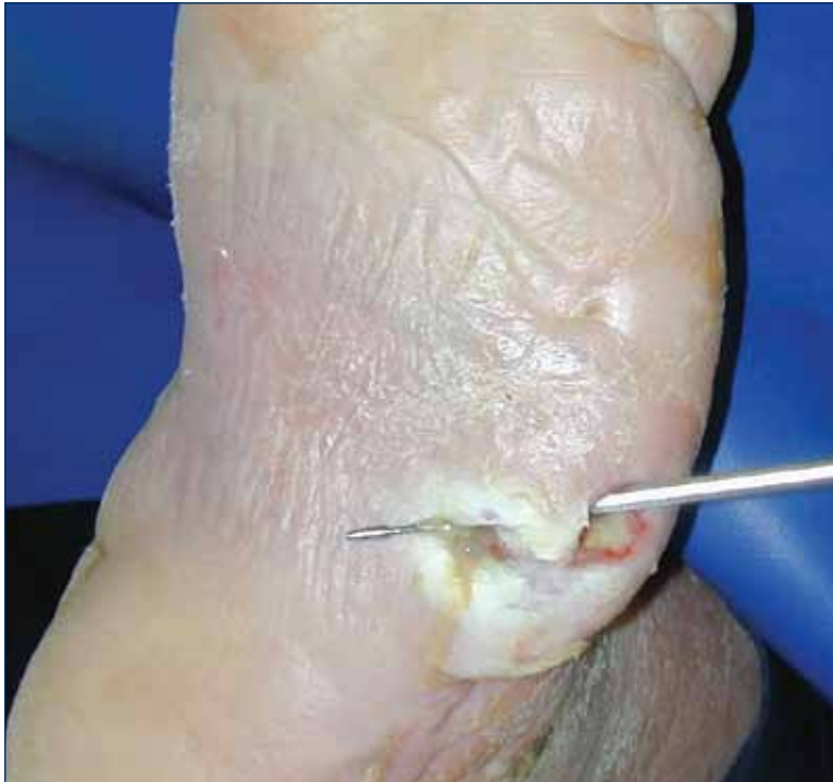
Figure 2. Moderate infection, showing exudate and local abscess.

a swab; tissue or liquid pus give better indication of the infecting organism. The IDSA classification is outlined in Box 4 .