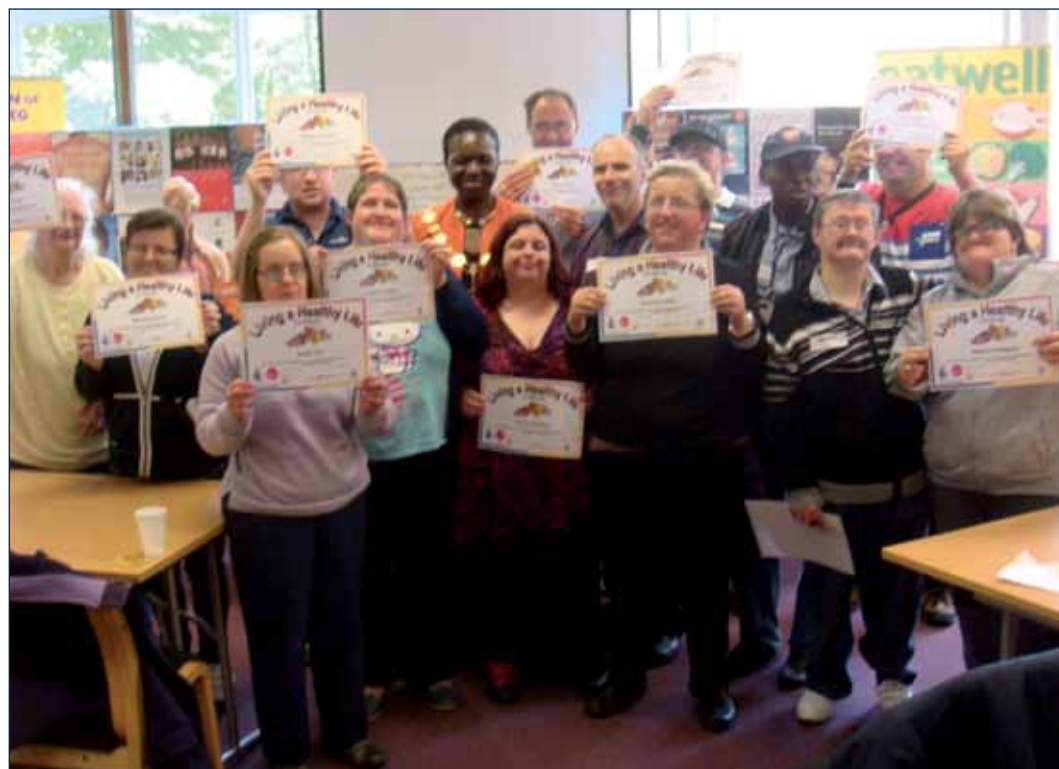
Adults with learning disabilities attending a “Living a healthy life” educational session on diabetes and healthy living proudly show their certificates of participation.

“In regard to improving our education and screening sessions, we are looking at ways of making the explanation of diabetes more interactive as well as providing certificates for achieving target blood glucose testing results.”