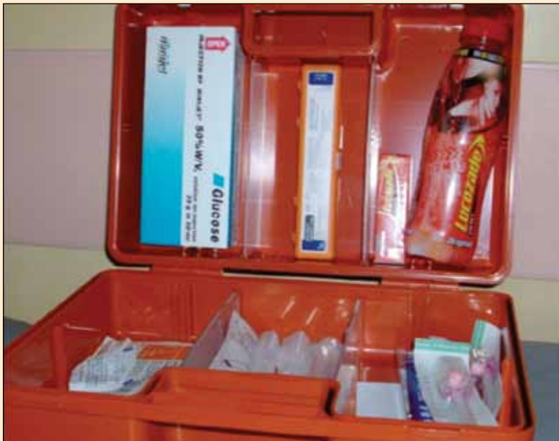
Figure 1. A “hypo box” should be well stocked, labelled and placed on each ward for immediate access to treatment for hypoglycaemia.