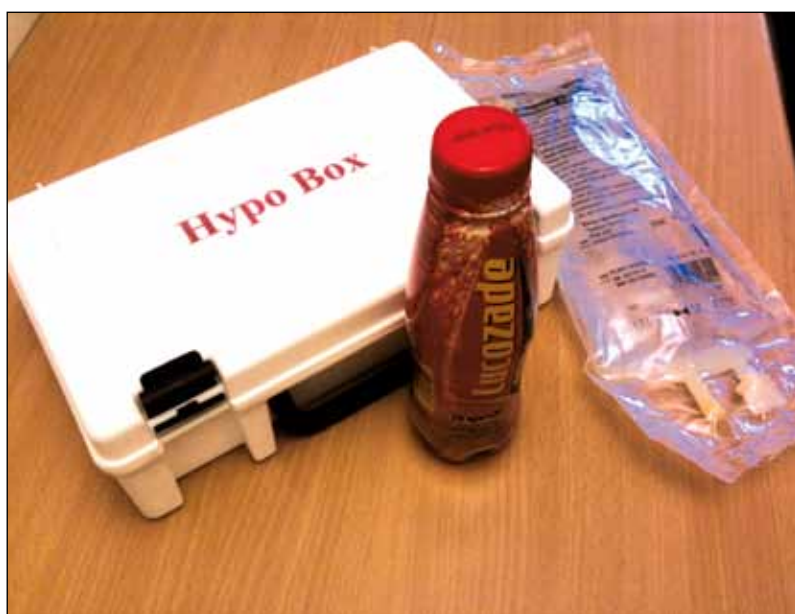
Figure 1. The hypo boxes issued to all wards contain intravenous 10% dextrose, Lucozade and glucose powder.

The poor response to the questionnaires and the limited numbers who attended the teaching sessions was reasonable and expected in the current climate of short staffing and limited access to study leave.