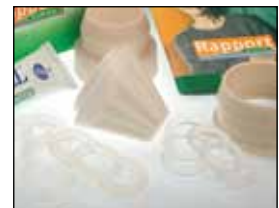
Figure 4. Constriction bands for use by men who are able to achieve but not sustain an erection.