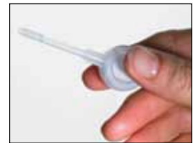
Figure 3. Intra-urethral alprostadil applicator.