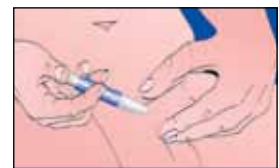
Figure 2. Illustration showing an intra cavernosal injection.