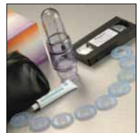
Figure 5. Vacuum device, constriction bands and explanatory video.