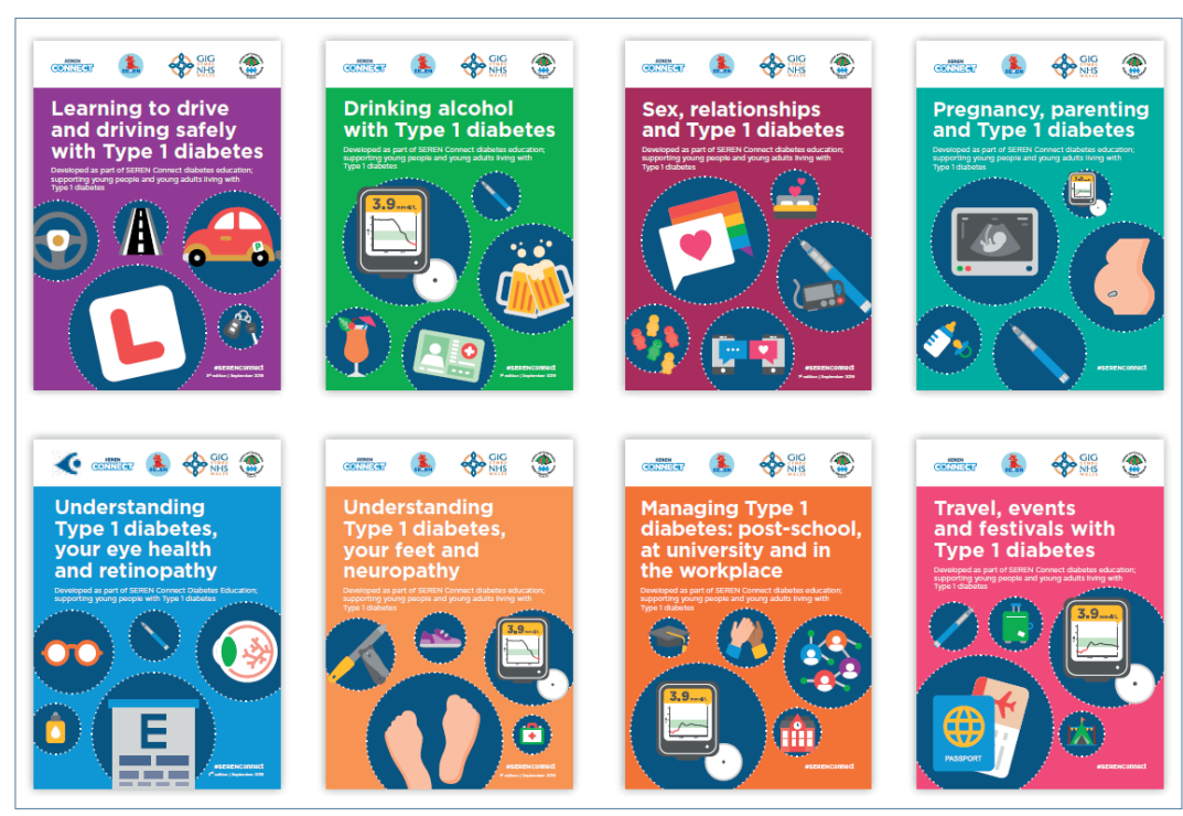
Figure 2. Booklets containing take-away messages are given to young people attending the course

on areas in which the young person needs further support, changes to treatment, and more clinical aspects of care. It is hoped this will result in more quality conversation between the young person and healthcare professional and improve engagement.