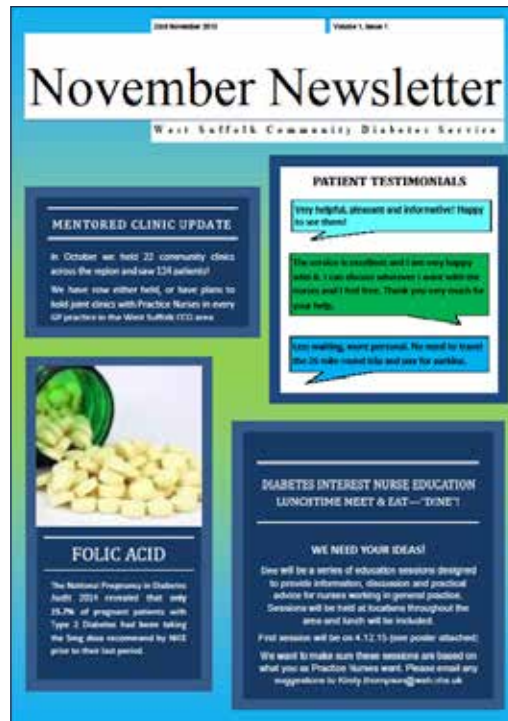
Figure 2. A newsletter is distributed to all practices with access to the service.

West Suffolk CCG is planning to invest in the Diabetes Dashboard, which gives live diabetes data that can be interpreted for individual practices. This has been recommended by a neighbouring CCG. We are able to review our individual practices' QOF data when we are in the practices, allowing us to assess their individual progress and shape the service offered. We also use fingertip data provided by Public Health England to monitor our overall progress and that of individual practices. Fingertip