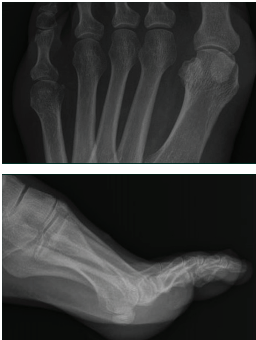
Figure 2: Left foot X-rays showed no signs of osteomyelitis or soft tissue gas.

department and was admitted for the fourth time (approximately 13 months after DFU onset).