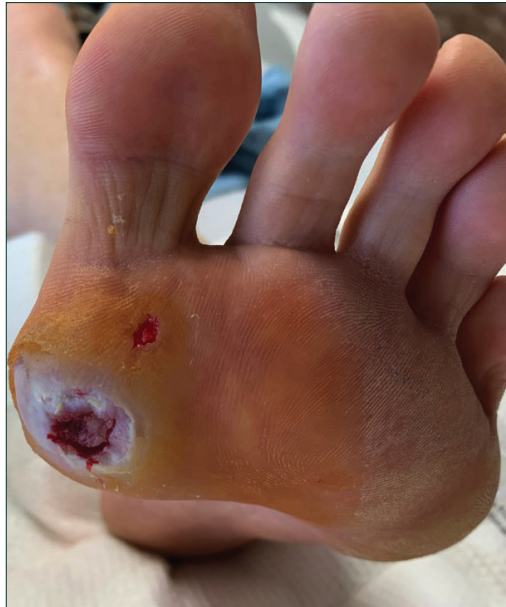
Figure 1: Left foot DFU after debridement on day one of hospital admission.

Localised sesamoid osteomyelitis from a DFU is rare, and it is more common for osteomyelitis of the sesamoid to be caused by a puncture wound (Karasick and Schweitzer, 1998). A study of isolated sesamoid osteomyelitis without metatarsal head involvement took 13 years to acquire 18 patients with sesamoid osteomyelitis (Mauler et al, 2017). Osteomyelitis was diagnosed with imaging changes (i.e. MRI, computed tomography, or plain radiographs) in conjunction with an ulcer that probed to bone. All 18 patients were first treated non-surgically with wound care, offloading and antibiotics. The non-surgical therapy ranged from 4 weeks to 9 months. Ultimately, 15 of the 18 patients required surgical excision or amputation of the osteomyelitis to heal their associated ulcer. This study alludes to the difficulty of treating