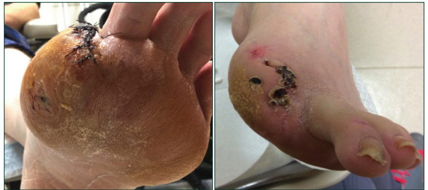
Figure 4. Healed DFU and partial first ray amputation at post-operative day 26.

operative course and the amputation site and DFU healed in 26 days (Figure 4). He continued and completed the 6 weeks of ceftriaxone through a PICC in the peri-operative period. The ceftriaxone was not help for collection of surgical cultures