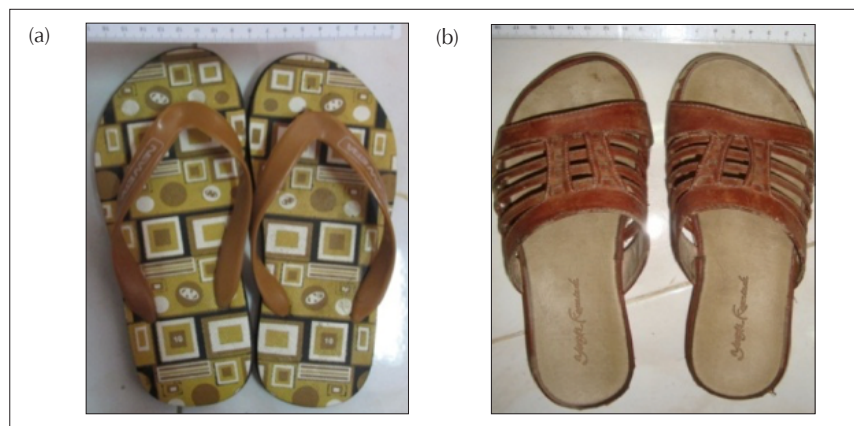
Figure 1: Footwear was defined as (a) thong sandals, which have two straps, extending toward either the medial or lateral heel, with an insertion point between the first and second metatarsals; or (b) belt sandals, which have a belt covering the dorsal forefoot.

well understood. The aim of this study was thus to investigate the relationship between different types of sandal and DFU characteristics.