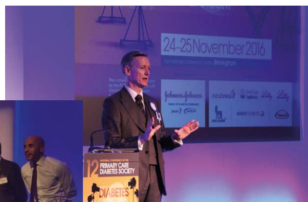
Photos from the 12 th National PCDS Conference.