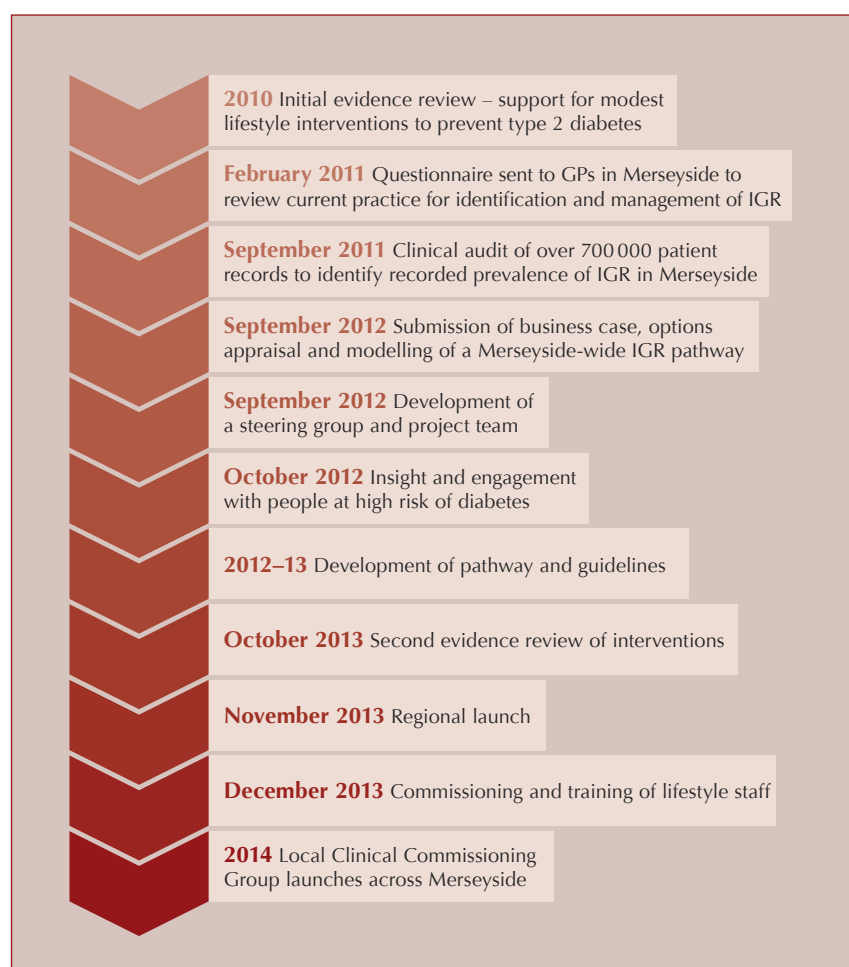
Figure 2. Development timeline for the Merseyside Impaired Glucose Regulation (IGR) Pathway.

NHS Health Check modelling yielded an estimated IGR prevalence for England of 2.3%