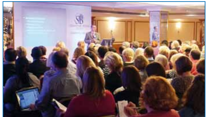
The smaller breakout sessions offer delegates an opportunity to pick the brains of the experts on a wide range of topics

Over 12 hours of accredited CPD available