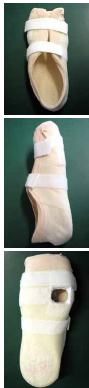
Figure 1. The Ransart boot.