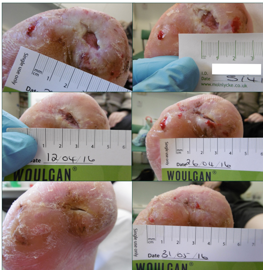
Figure 2. (a) Wound on initial presentation. (b) Wound at week 1. (c) Wound at week 2. (d) Wound at week 4. (e) Wound at week 7. (f) Wound at week 9.

her amputation site also, as the current alginate dressing was adhering and causing discomfort. The amputation site was assessed at this stage as being suitable for use of Woulgan Biogel as the exudate levels had reduced and were now considered moderate. Figure 1 details the wound healing process.