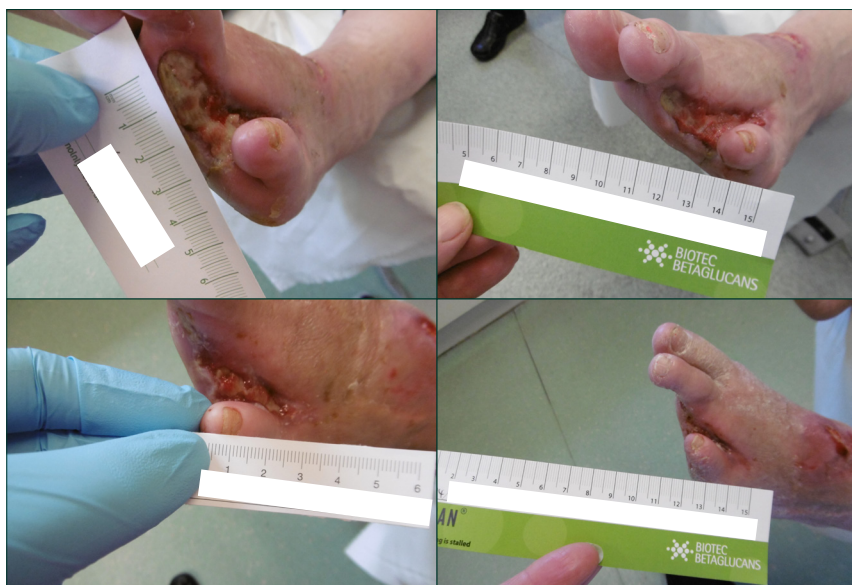
Figure 1. (a) Initial presentation of amputation site. (b) Wound at week 2. (c) Wound at week 4. (d) Wound at week 10.