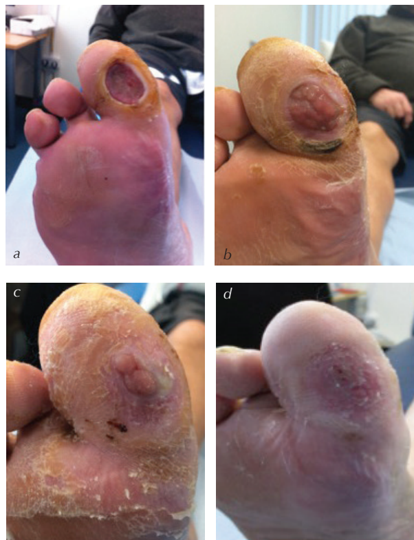
Figure 3a. Case one — Pre-TCC-EZ (November 18 2014). The wound measured 30mm x 18mm x 4mm. Figure 3b. One month after start of treatment with TCC-EZ (December 22 2014). The wound had decreased in size and now measured 20mm x 12mm x <2mm. Figure 3c. Ulcer almost healed (January 13 2015), measuring 10mm x 5mm x <2mm. Figure 3d. Ulcer healed 11 weeks (January 27 2015).

It took 6 weeks before he was seen in the orthopaedics department and he was placed into TCC. Once healed, he remained ulcer-free until January 2014, at which time the area broke down due to mechanical trauma.