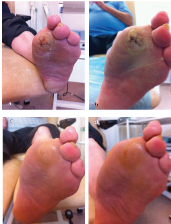
Figure 4a. Wound prior to debridement and commencement of TCC-EZ cast (September 16 2014). Wound measured 7mm x 6mm x 2mm. There is heavy surrounding callus; the wound is static with adhered slough at the base; there is moderate exudate and oedema in the lower limb. Figure 4b. Wound after debridement following removal of cast (September 18 2014). Wound measured 5mm x 4mm x 1mm. There was light surrounding callus. Wound had reduced in size with peelable slough, granulation tissue, moderate exudate and strikethrough to the dressing. Limb oedema had reduced. Figure 4c. Wound following cast removal (October 7 2014). Wound has healed. There is light surrounding callus. Wound is epithelialising and there is no exudate on the dressing. Figure 4d. Wound post cast removal (October 14 2014). Wound is completely healed with minimal surrounding callus and no exudate on dressing removal. Surrounding skin looks healthy and well hydrated.

Although the patient did not heal within the 6-week average, he could clearly see the weekly improvement, which was encouraging, and he was happy to