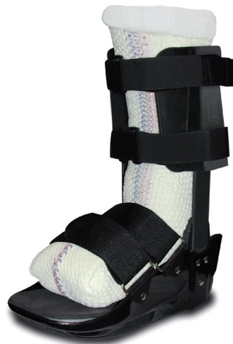
Figure 2. TCC-EZ casting device.

Where TCC-EZ has been trialled in Solent NHS Trust, it has helped to get more patients into TCC and avoided delays in referral to the orthopaedic department. It can be applied by a practitioner who has received the relatively simple standard competency training — there is no need to refer on — allowing the patient to stay in the system, rather than being lost to another service. The TCC-EZ cast comes as an off-the-shelf pack and can