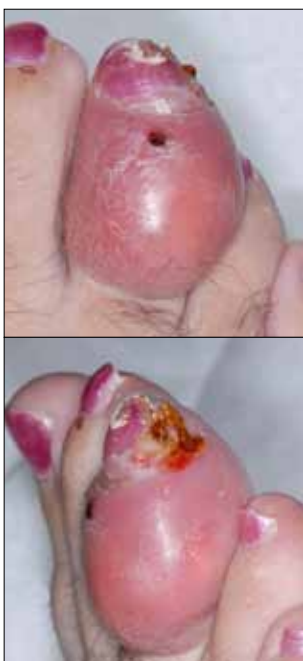
Figure 1. Severe chronic gout in toe of patient with diabetes. Tophi visible under skin and in wound base lateral aspect of nail.

In 2007, the British Society for Rheumatology (BSR) and British Health Professionals in Rheumatology published a guideline for the management of gout (Jordan et al, 2007) – the aim being to develop concise, patient-focused, evidence-based recommendations for the management of gout for doctors and allied health professionals. The guideline discusses