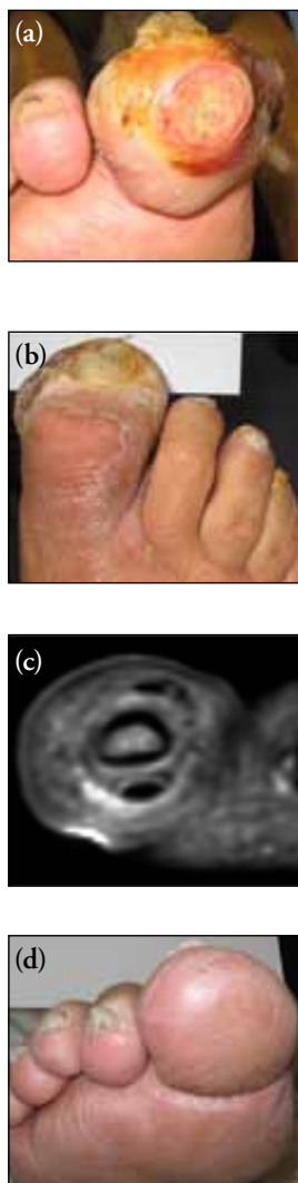
Figure 1. A neuropathic ulcer at the apex of the great toe treated by the multidisciplinary diabetic foot team at St Mary's Hospital, west London, according to the conservative management pathway detailed here. Note the (a–b) classic "sausage toe" appearance suggestive of underlying osteomyelitis; (c) corresponding coronal T2 weighted magnetic resonance imaging (MRI) in which the distal phalanx of the great toe returns hyperintense signal consistent with bone marrow oedema due to underlying osteomyelitis; and (d) the toe following 6 months of oral antibiotic therapy, during which both complete healing of the lesion and resolution of the underlying signal change on MRI were achieved.

diagnosing osteomyelitis associated with a neuropathic lesion require bone signal change to be in direct contiguity with signal change in soft tissue that is adjacent to the area of ulceration. We have found that remote areas of signal change on MRI, particularly involving mid- and hindfoot areas, are common and of unknown clinical significance (Thorning et al, 2010).