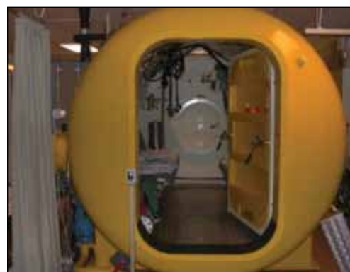
Figure 2. An example of a multiplace hyperbaric chamber.

Multiplace chambers are annexed by an antichamber and contain air. People receiving therapy in a multiplace chamber breath 100% oxygen via a rubber or silicon hood or mask, thereby reducing the risk of fire, but making therapy more arduous for the person receiving therapy.