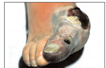
Figure 3. An ischaemic hallux with surrounding cellulites