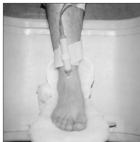
Figure 1. The position of the foot during MT treatment. The Doppler probe is fastened over the dorsalis pedis artery.

Owing to a lack of resources for double-blinding, every effort was made to eliminate operator bias in the single-blind trial. Before testing, each participant rested on a plinth for 15 minutes in a dedicated, quiet room under controlled temperature (22–25°C) and humidity (50–70%). The foot to be tested was thoroughly cleansed and placed inside a specially designed, cushioned brace. The participant lay supine, as extreme flexion of the hip and knee would result in a decrease in arterial flow of the ankle. A blanket covered the participant,