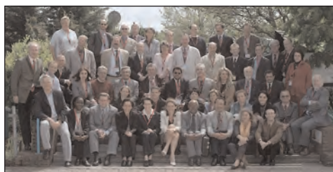
Figure 1. The IDF Consultative Section on the Diabetic Foot/ International Working Group on the Diabetic Foot during the meeting

The aims of the wound care document were to provide state of the art information on wound healing, on barriers to healing, and on treatments for diabetic foot ulcers. Unfortunately, it became clear to the International Consensus Working Group that the evidence base to produce practical guidelines on wound care is lacking. The current document should therefore be seen as a progress report, which was agreed upon at the Consensus/Implementation meeting. During this meeting, it was also decided that there is a great need for practical guidelines and a more evidence-based report. The IWGDF hopes that within the next few years more solid data will become available. Therefore, it was decided that the present consensus process will be continued and that within 4 years, the practical guidelines will be produced, in combination with a shorter version of the current document.