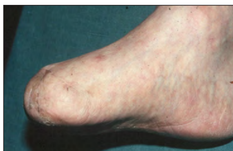
Figure 5. Transmetatarsal amputation.

adequate foot circulation to allow minor amputation and debridement, and achieve healing without revascularisation. Only 39% of the patients achieved healing whilst over a third had ongoing infection and 40% exhibited recurrent infection during follow-up. The patients who ultimately had a limb amputated, experienced almost 12 months of clinic visits and dressing changes before amputation, indicating significant quality of life issues with this approach. At the end of the 5 year follow-up period, only 54% of the patient cohort had retained the affected limb. Clearly case selection is vital in the attempt to salvage the diabetic foot.