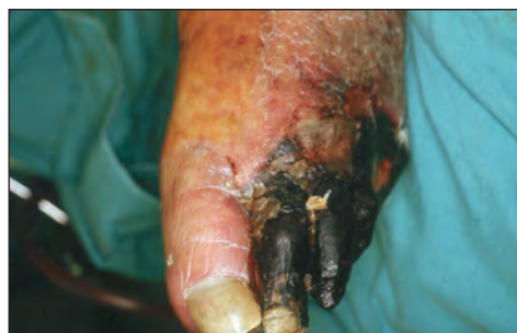
Figure 2. Diabetic gangrene of the lateral four toes of the foot.