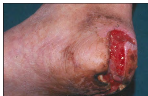
Figure 1. Deep neuropathic heel ulcer.

The clinical history may help to provide symptoms of peripheral vascular disease, (e.g. intermittent claudication and rest pain)