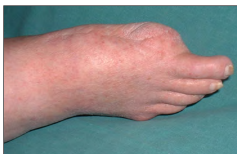
Figure 4. Healed ray amputation of the hallux two years after concomitant distal bypass.

4 Revascularisation seems the sensible option to take if a viable and functional limb is to be the end result of treatment.