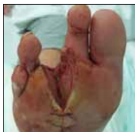
Figure 4. Postoperative amputation site.