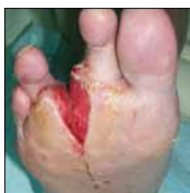
Figure 5. Eleven days after commencing Kerraboot treatment: granulation of the amputation site.