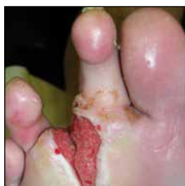
Figure 6. Three weeks after commencing Kerraboot treatment: Continuing granulation of wound site.