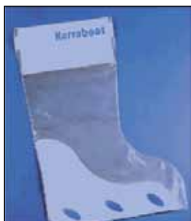
Figure 1. The Kerraboot.

500mg qds and amoxicillin 500mg tds. A swab of the ulcer was taken for microbiology. The results of a Doppler scan showed that all pedal pulses in the right foot were biphasic.