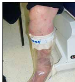
Figure 9. Continuing use of Kerraboot postoperatively.