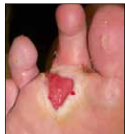
Figure 8. Ten weeks after commencing Kerraboot treatment: Re-epithelialisation.