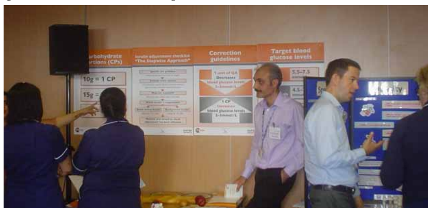
Figure 2. The taster session workshop.