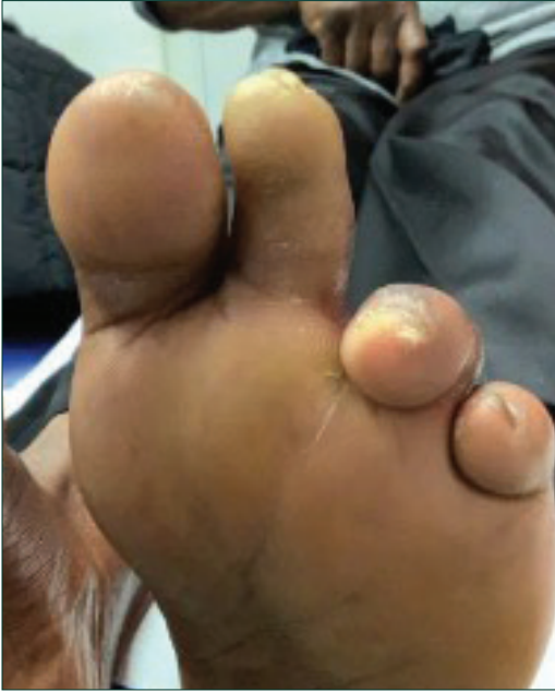
Figure 5: Post-procedure clinical photograph of plantar left foot.