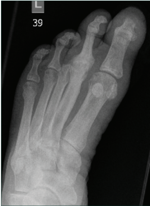
Figure 1: AP X-ray left foot.