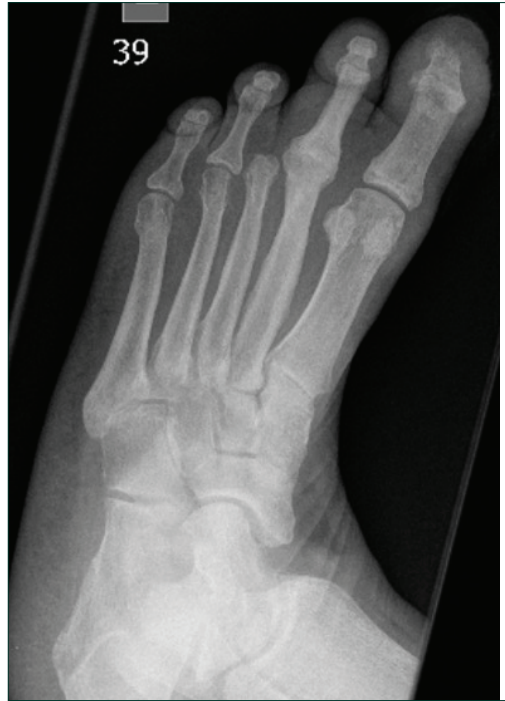
Figure 2: A Böhler walker.

ulcers support surgical offloading treatments. The evidence for digital tenotomy of the flexor tendon is strong with the desirable effects deemed to be moderate. The IWGDF recommends performing digital flexor tenotomies in individuals with diabetes and callus, or an ulcer on the apex or distal part of a non-rigid hammer toe to prevent development of ulceration or recurrent foot ulceration (Bus et al, 2020).