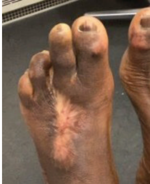
Figure 6: Post-procedure clinical photograph of dorsal left foot.

was poorly controlled with a HbA 1c of 97mmol/mol. At the time of the treatment, she presented with a left apical hallux ulcer with negative probe to bone test, pressure lesion to the hallux dorso-medial interphalangeal joint and second toe apical callus with remission of the ulcer (Figures 3 and 4). On clinical assessment of the toe deformities, there remained some flexibility despite the second metatarso-phalangeal joint being affected by degenerative joint disease. Claw toe deformities were noted to the fourth and fifth digits but there was no history of callus or ulceration.