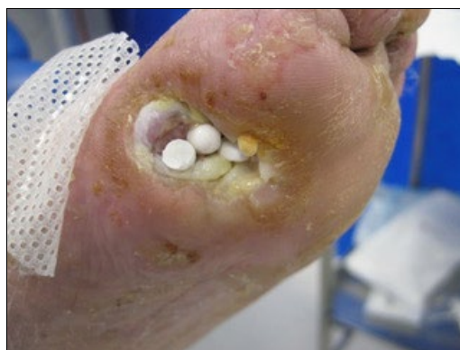
Figure 1 (above left) and Figure 2 (above right). Examples of Stimulan beads in situ.

control, local wound care and offloading if required (Lipsky et al, 2019).