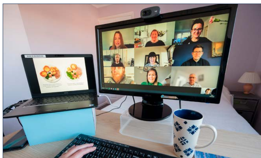
Figure 2. An online education session.