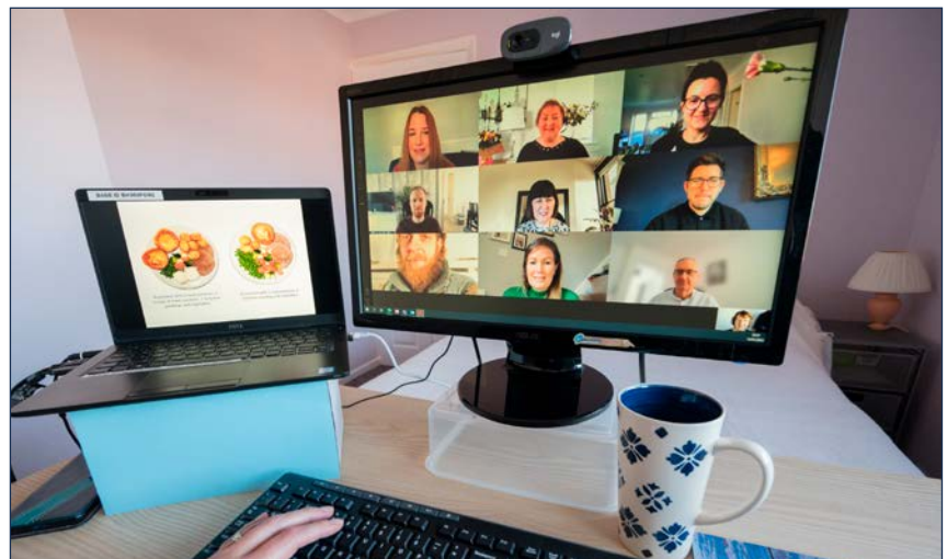
Figure 2. An online education session.